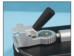
New trigger for quick & easy removal

Phone 888.724.8763 • 781.982.7000 | Fax 781.982.7001 | www.schuremed.com